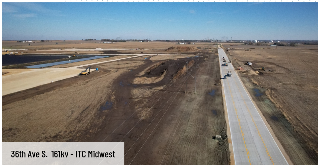
36th Ave S. 161kv - ITC Midwest

Companies locating within the park will meet with design engineers to determine the layout that best meets their rail needs.